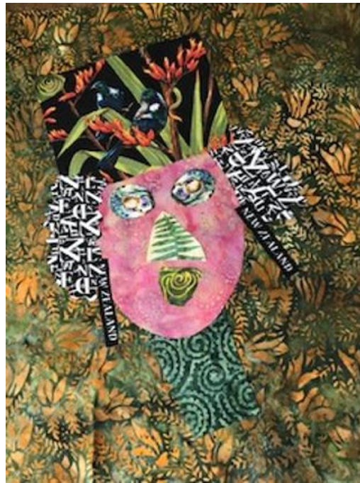
Funny Face by Leonie Batkin