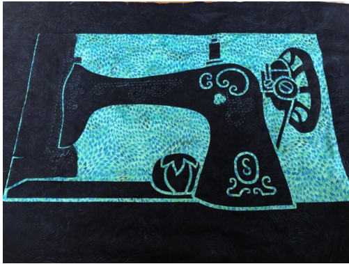
Pacific Rim 2-fabric Applique by Gale Green