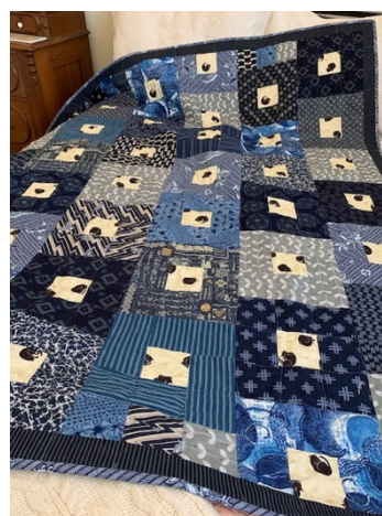
Judy Brum: Quilt of Extra Squares