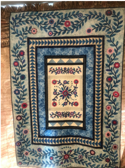
Joyce Wheeler: My Garden