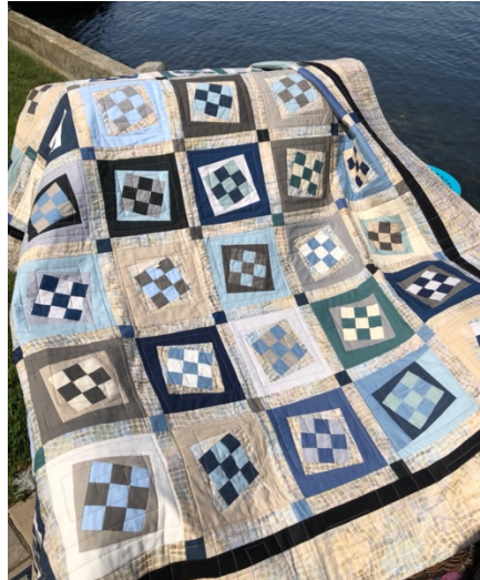
Gale Green: Remembering Red (left) and Happy Wonky