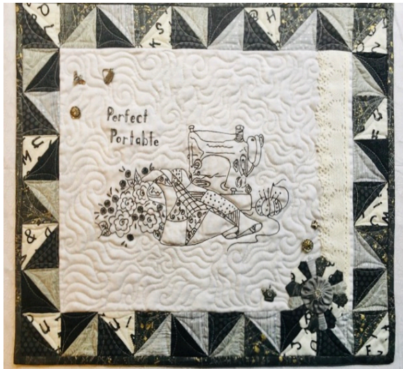
Julie Curry - P is for Perfect Portable – *Winner Viewer's Choice