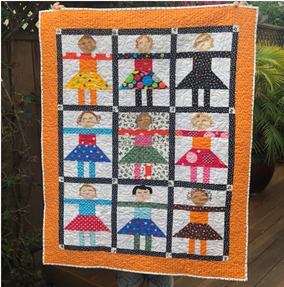
Lori Atwood -Polka Dot Paper Dolls