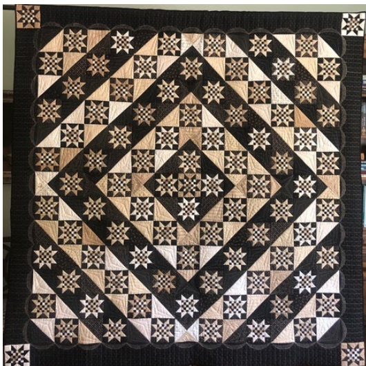
Angi Merlone – Stars Hollow