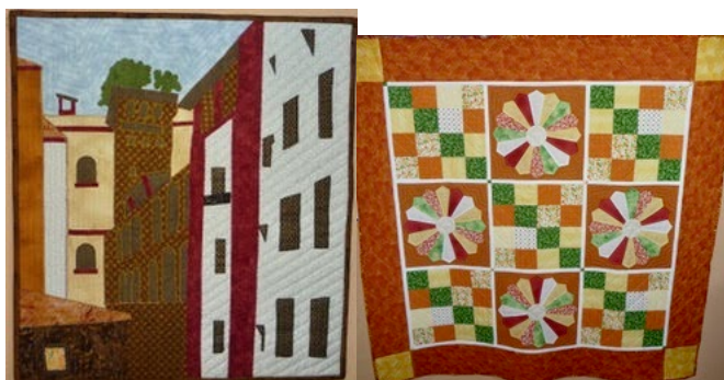
Gwen Matteucci -Guinigi Tower in Italy (left), Sugar & Spice