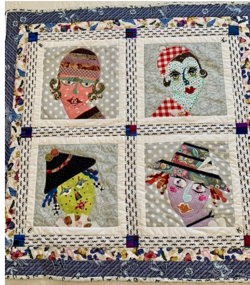
Judy Brumm – Four Personalities