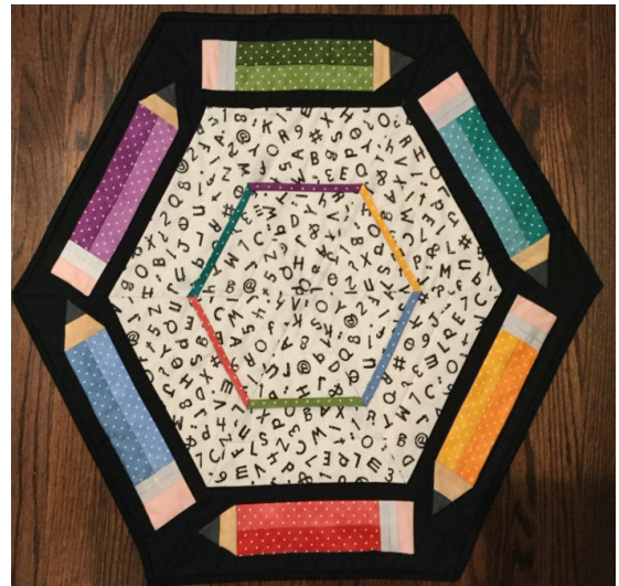
Mavourneen Lopez - Polka Dot Pencils - *Winner Best Use of Challenge Fabric